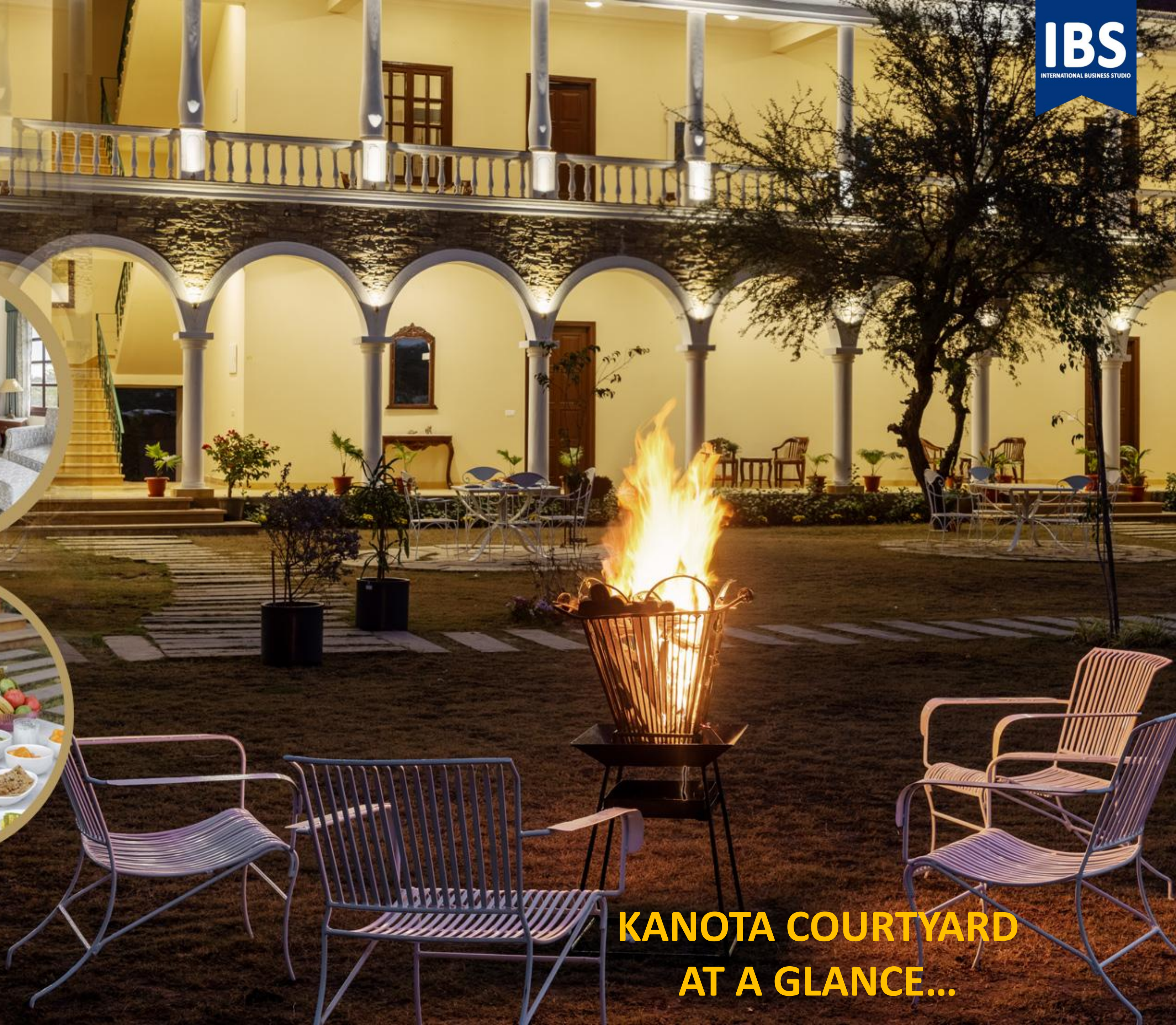
KANOTA COURTYARD AT A GLANCE...